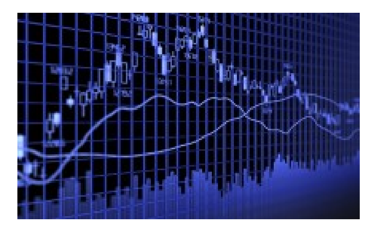
29 JANUARY, 2015